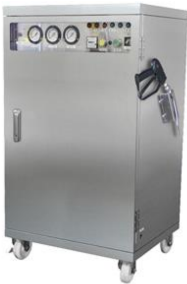
TC RESCUE RO

2A of Electricity Usage for energy saving!