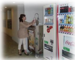
① Daily use

Storage battery & TC RESCUE RO has been set for daily/emergency used for natural disaster at a tower condominium and hospitals. Able to supply drinking water, sterilizing water and daily used water.