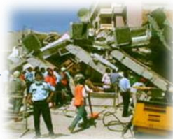
② Life line stops by natural disaster