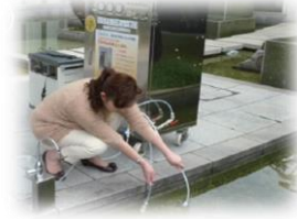
④ Water supplied from pond