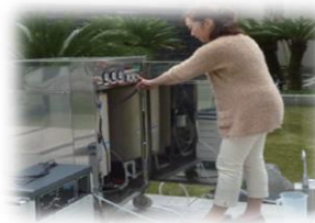
⑥ Can be easily operated just by pressing button