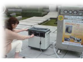
⑤ Set up of condenser