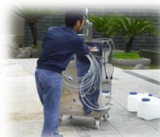
③ Easily moveable