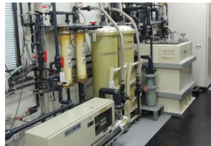
Achievement: Used in many kinds of ultra pure water system